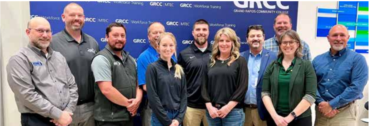
This May, officials from Grand Rapids Community College and the City of Grand Rapids presented $1,200 in scholarship funds to students who attended the 2023 water career camp.