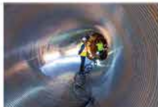
SPIRAL WOUND PVC