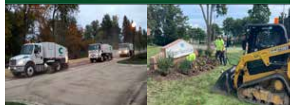
STREET SWEEPING / POWER WASHING LANDSCAPE / HORTICULTURE