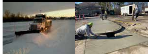
SNOW / ICE CONSTRUCTION / PAVEMENT