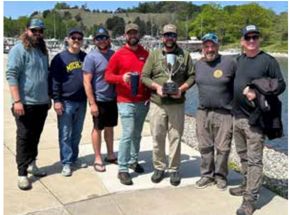
The 2024 tournament winning team