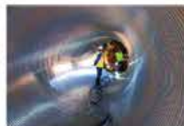
SPIRAL WOUND PVC