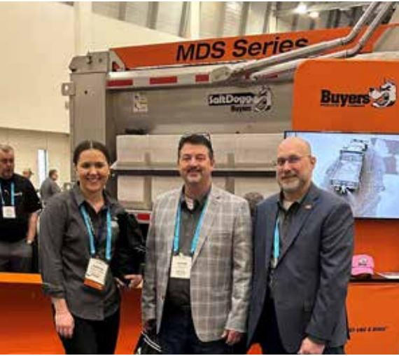
Michigan Chapter Snow Conference Leadership