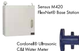
Sensus M420 FlexNet Base Station