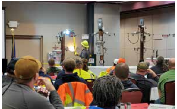
Live line electrical training