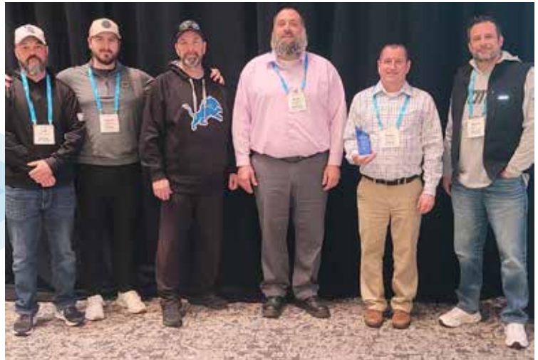
Bloomfield Township received the 2025 Excellence in Snow and Ice Control Award by APWA