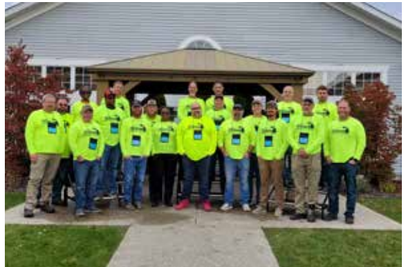
MRSP Graduation Class 2023

As you can see from the insights of just a few of the Road Scholar graduates, the program is hitting the mark and providing training our front-line personnel. If you haven't started sending your crew members yet, this can be your year! Registration for the 2025 Road Scholar program is now open. Register your front-line crew today and give them the training they need to be successful in your organization. Show them you believe in them too!