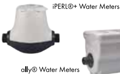
iPERL+ Water Meters